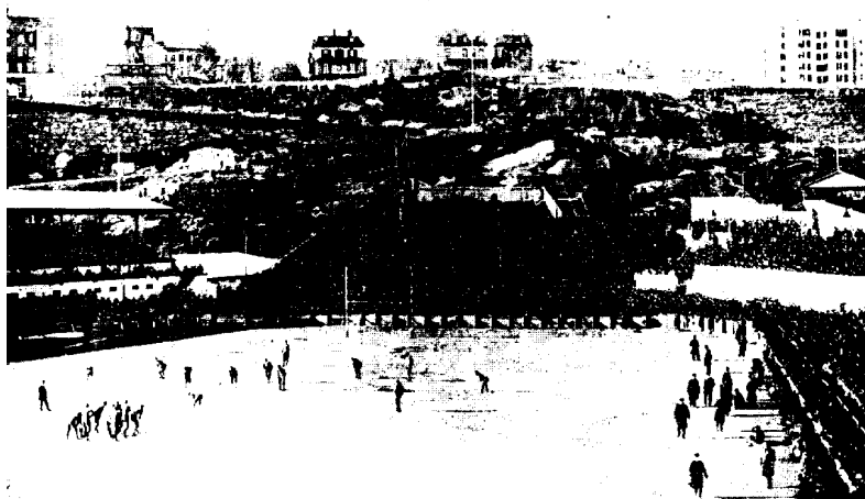
Princeton's Flying Wedge

Along with the evolution of offensive maneuvers arose defensive schemes to stop the imposing array of flying wedge plays. Yale, at times, simply avoided a massive collision. Rather than charging its men to meet the converging wedge, the men in blue sweaters stood aside, let the Harvard interference run through, and then tackled the unprotected ball carrier.” Harvard, though, opted for alternative defensive methods. Taking positions five yards behind the line of scrimmage, Crimson defenders began their own mighty assault the instant Yale shot forward. The disastrous result: 22 men in a crumpled heap, bodies bruised and bones broken.