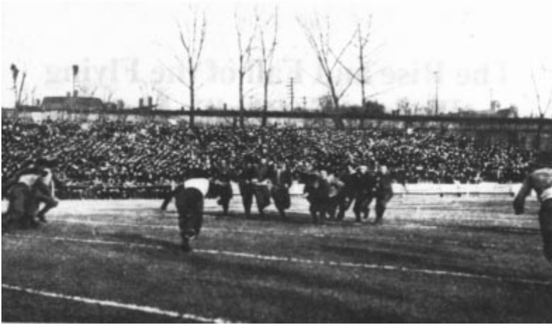
Harvard's Flying Wedge was the ultimate of the mass momentum plays.

foot, then pick it up and pass it to a teammate. The startling new flying wedge necessitated the latter option.